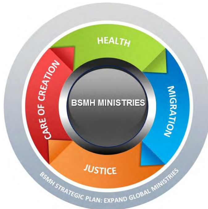
Diagram I: Global Ministries Program Priorities (2019-2021)

Since its inception in 2007, Global Ministries co-developed and funded, a maternal and child health collaborative in Peru to address maternal and child mortality following the United Nations Millennium Development Goals (MDGs) adapted in 2000. The MDGs provided an eight goal blueprint for the world's countries and civil society at large to cut extreme poverty rates in half and address health disparities by 2015.