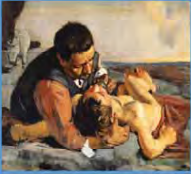
The Good Samaritan Ferdinand Hodler, 1885