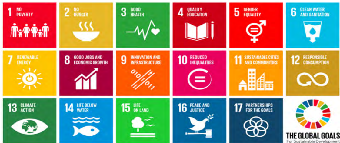
Diagram II: United Nations Sustainable Development Goals (2015-2030)

achieved by 2030. The U.N. recognizes that addressing global health disparities can only be done when governments, individuals and corporations unite as a global family to address extreme poverty, inequality, health disparities, and climate change.