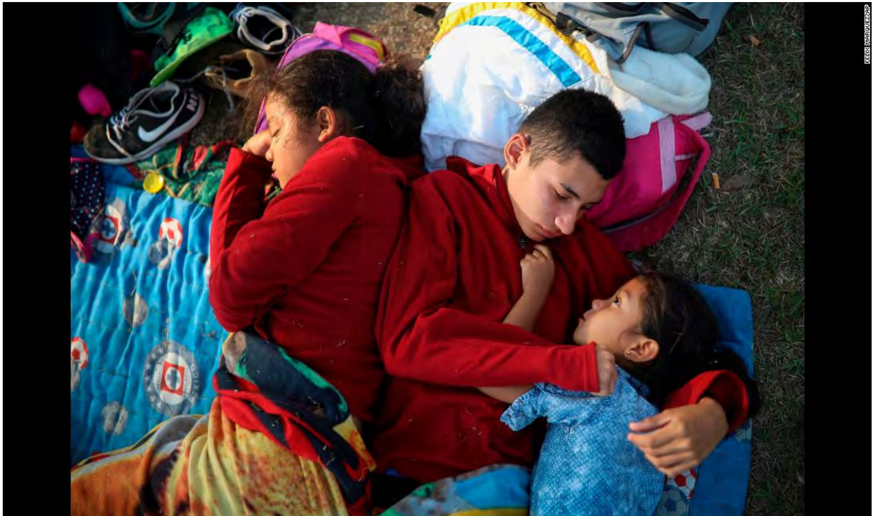
Children Seeking Refuge from Violence Border Crossing, 2018